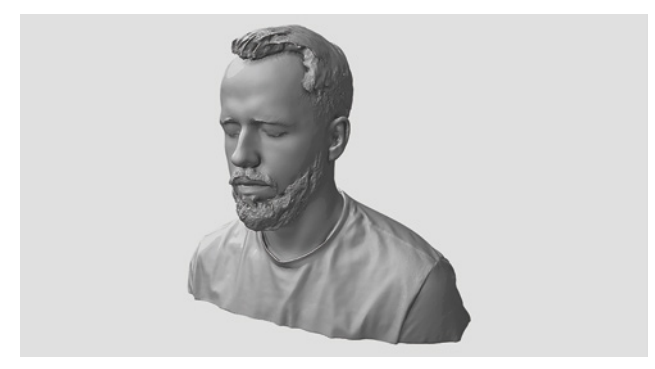
Statues, and the human body