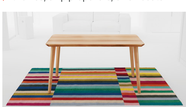
Furniture and room interiors