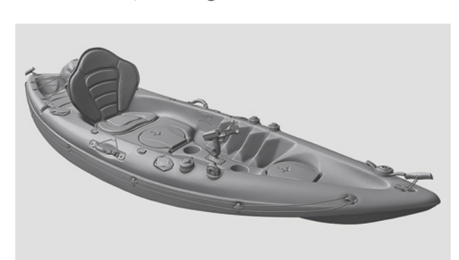
Turbines, ship propellers, small boats